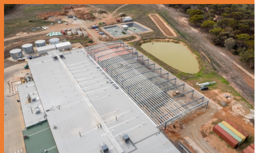
Process Building Extension—Monarto SA