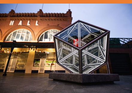
Public art coordination

The nature and legislative obligations in the local government sector create unique requirements, whether it be community stakeholder engagement, probity considerations or other factors. TOR Projects can assist with projects from initial grant application to handover.