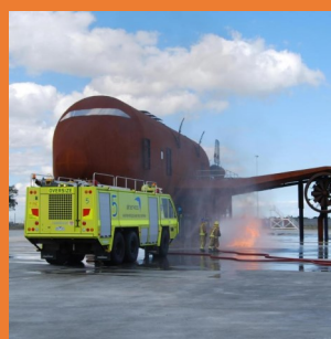
Fire Training Ground—VIC