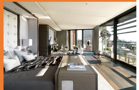
One Hyde Park Residences—London