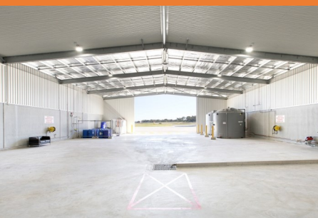
Foam Test Facility—Newcastle NSW

From fully automated greenfield processing facilities to minor plant upgrades, TOR Projects will get your vision on the ground and operational sooner.