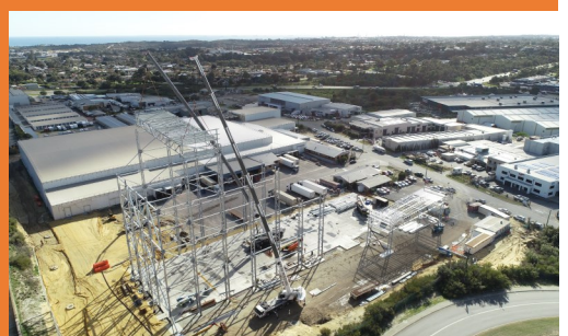
Automated Freezer Building—Bibra Lake WA