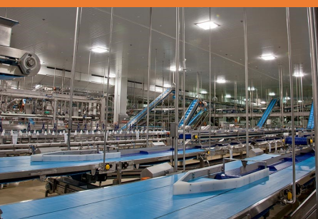
Poultry Processing—Somerville VIC