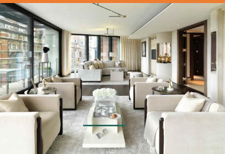
One Hyde Park Residences—London

If you are looking for a unique residential project, look no further. With a focus on sustainable and custom residences, TOR Projects can help make your new build something special.