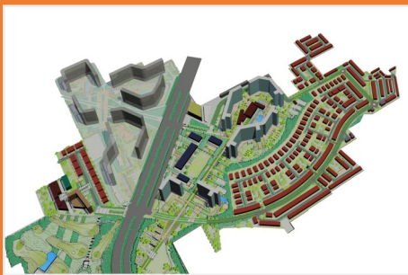
Uniworld Master Planning—India