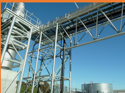
Process Building—Edinburgh SA