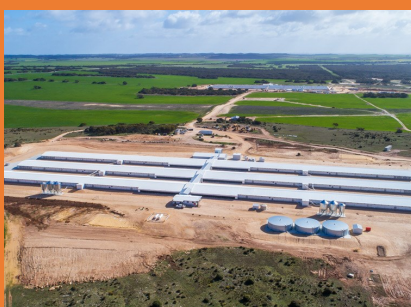
Farming Sheds—Yumali SA