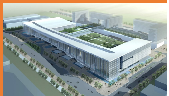
Beijing Olympic Convention Centre—China

The images above represent a selection of completed projects through previous employers. Further project details can be found via LinkedIn , or if you would like further information on specific projects or industries please get in touch.