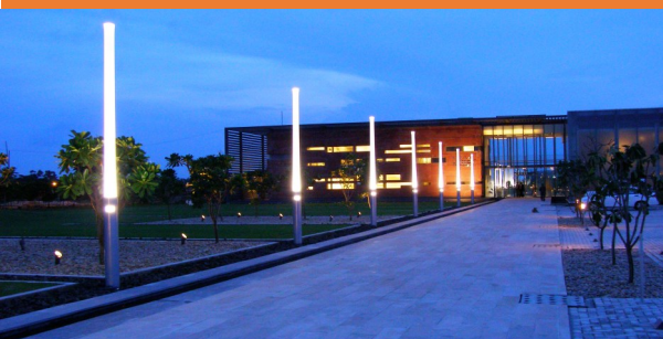
Uniworld Sales Pavilion—India

Whether it be a minor refurbishment on an existing property, or a major development your project will be in good hands from start to finish with TOR Projects.